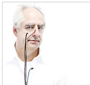
William Kentridge

One morning in February, in the bowels of the Metropolitan Opera House, Mr. Kentridge, 54, and a small army of artistic personnel were rehearsing a chase scene involving a dozen Russian answers to the Keystone Kops.