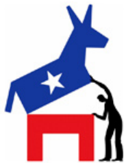
Democrats Need a Rally Monkey