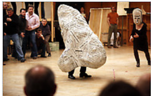
The title character, in a rehearsal.