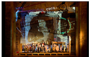
Metropolitan Opera Technical Department