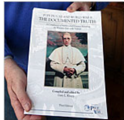
A Jewish Knight for a Wartime Pope